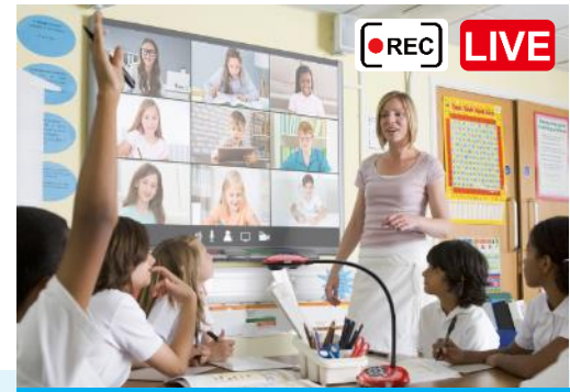
#3 Recording & Live Streaming

Stream your lectures, campus events, graduations or other ceremonies on various streaming platforms.