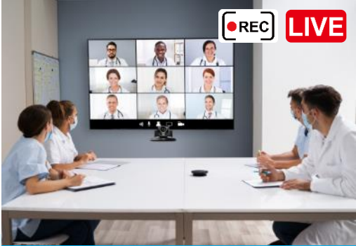
#3 Recording & Live Streaming

Live surgical solutions provide real-time monitoring of surgical progress for remote doctors or trainee teaching.