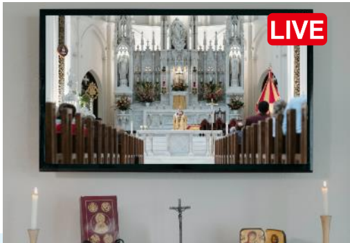
#2 Live Streaming

Record masses, sermons, and other religious services and activities. Store the meaningful moment of each event forever.