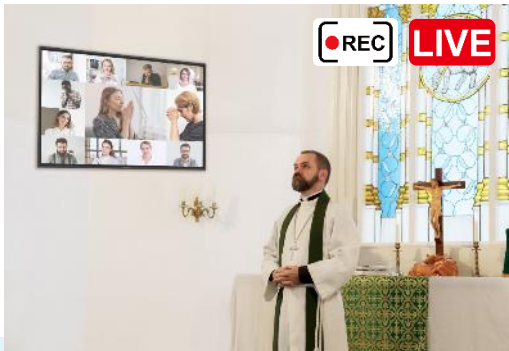
#3 Recording & Live Streaming

Provide online sermons and classes. People who cannot attend services in person can still feel involved. Extend the reach among worshippers.