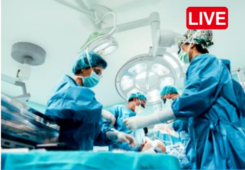
#2 Live Streaming

Record Surgical process. Medical students can learn and practice from their own side.