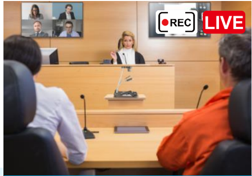
#3 Recording & Live Streaming

Streaming court proceedings delivers transparency to the judicial system and further elevates public confidence in the judicial system.