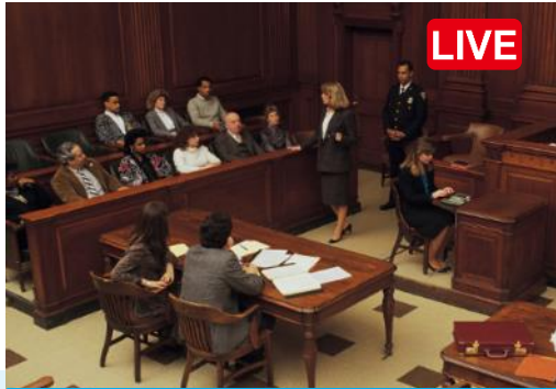
#2 Live Streaming

Recording proceedings is standard practice in most judicial systems. Digital archiving makes it quick, efficient and transparent to review, analyze and report cases.