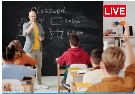
#2 Live Streaming

Record lecture allows students to review the captured course 24/7 online.